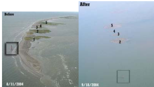
Chandeleur Island Lighthouse, before and after Hurricane Ivan 2004

This is from a recent set of photographs of the Chandeleur Island Chains found on Chart 11363. The conversion of the islands into submerged shoals for a large amount of the chain is part of the background in submitting proposed plan for chart update to 11363 to show the reduction of the island chain into open water for a very significant area of the feature