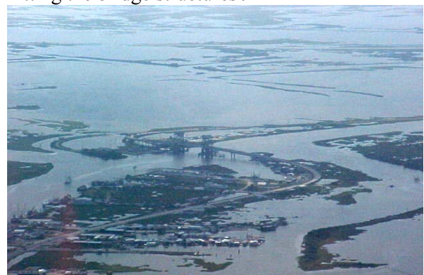
View of Leeville Bridge

USCG Marine Safety Unit, Houma requested that NOAA post a warning of hazard notice to NOAA's Coast Pilot for the area of Bayou Lafourche at Leeville Bridge. Eleven reported vessel strikes to the bridge have been recorded for this year. The presence of high current conditions at the bridge has made for the potential of vessels losing navigation control and hitting the bridge structures .