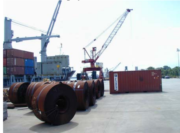
Purple Beach Containers and Steel Rolls at Globalplex

Globalplex is modeled to meet the specific needs of small and mid-sized industrial, distribution, and manufacturing operations.